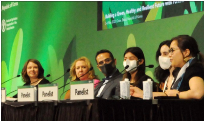
Second panel of the special event, The Future is Now

CIFOR's West Africa Forest-Farm Interface Project have played a big part in her career development, although these opportunities were limited early on in her career.