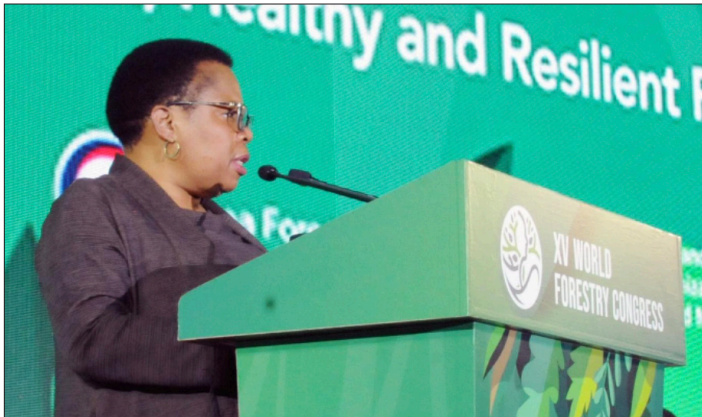
Makhotso Magdeline Sotyu , Deputy Minister of Forestry, Fisheries and Environmental Affairs, South Africa

General Directorate of Forestry, Turkey, announced Turkey's interest in hosting the next meeting.