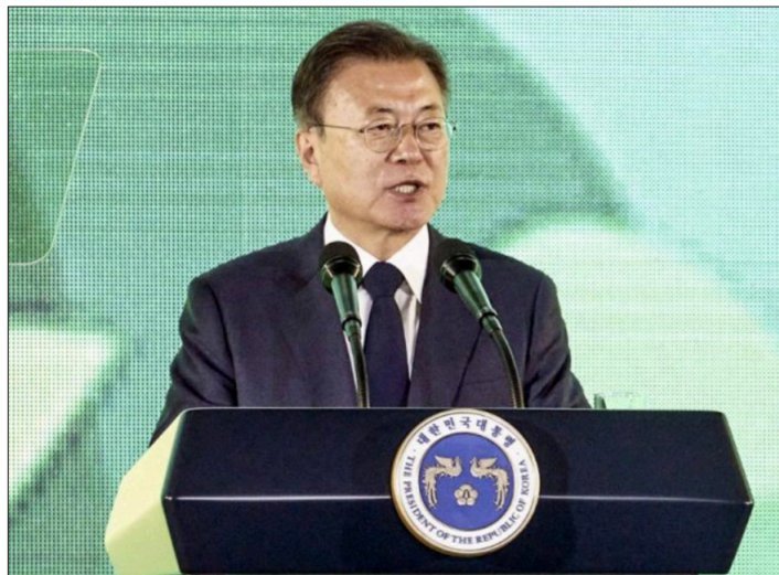
Moon Jae-in, President of the Republic of Korea

The main outcomes of the Congress include: detailed action proposals following the six sub-themes of the Congress; a Ministerial Call on Sustainable Wood; a youth call for action; and the Seoul Forest Declaration, which outlines shared roles and responsibilities for ensuring a sustainable future for the world’s forests. The Wangari Maathai Forest Champions Award 2022 was presented to Cécile Ndjebet, African Women’s Network for Community Management of Forests.