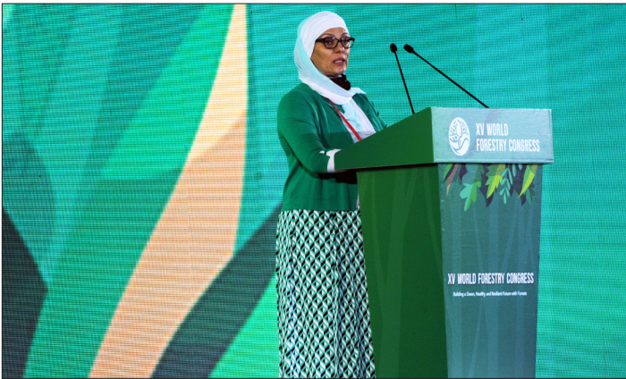
Princess Basma bint Ali of Jordan , FAO Regional Goodwill Ambassador

communities and making use of Indigenous Peoples' governance structures. Yugratna Srivastava, Youth Task Force, UN Decade on Ecosystem Restoration, and Youth Constituency Focal Point to the United Nations Environment Programme (UNEP), called for the inclusion of youth voices by mandate and not by invitation only, and for resources to ensure their meaningful participation.