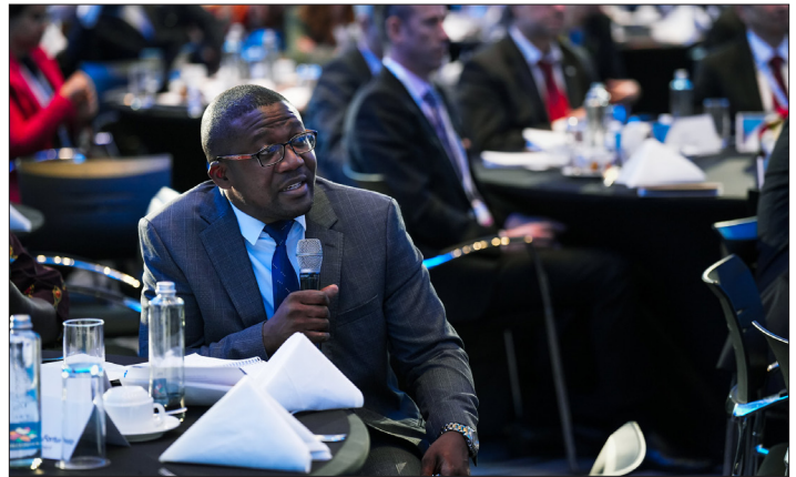
Nqobizitha Mangaliso Ndlovu , Minister of Environment, Climate, Tourism and Hospitality Industry, Zimbabwe