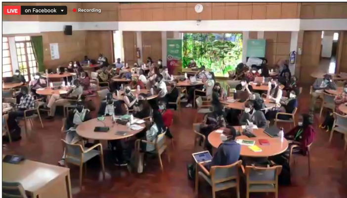
Participants during one of Sunday's sessions

Ščeponavičiūtė encouraged youth to aim to influence local and national governments prior to global fora, explaining that during global meetings, government representatives are often bound by instructions from capital. She lauded the EU as a model for other regions in successful youth engagement, explaining that all laws undergo public consultation. Rohr-Garztecki stressed the importance of young people finding ways to share ideas with country representatives that may be sympathetic to their demands to make sure these ideas are “put into the machinery, evaluated, and checked.”