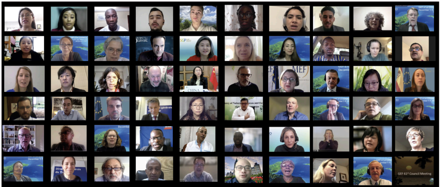
Participants at the 61st meeting of the GEF Council